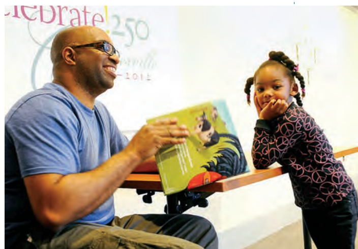
Author Kwame Alexander discusses his work with a young reader at the 2012 Virginia Festival of the Book.