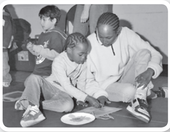
Thousands enjoy the Virginia Festival of the Book held every March in Charlottesville.